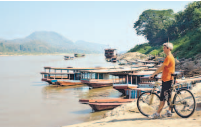
Serene scene: beside the Mekong River.

The airport is little more than a tin shed and when a plane lands the pilots get out and help unload the luggage—a good sign the tourist trail hasn't ruined the simple charms of this ancient city.