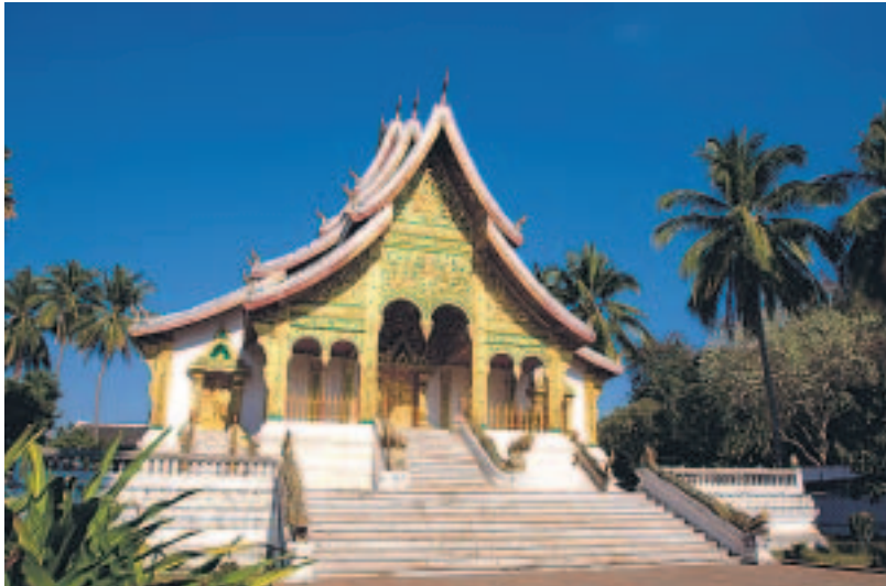
Relics: the former Royal Palace is now a national museum.

yet only a few will continue after the age of 18 to train to become a monk. Most novices will return to life in their home towns and carry the teachings of Buddhism for the rest of their lives.