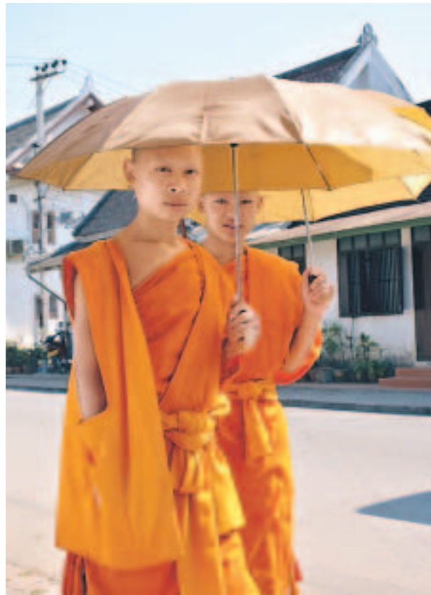
Shady guys: (above) monks carry golden umbrellas to keep the sun off their heads.