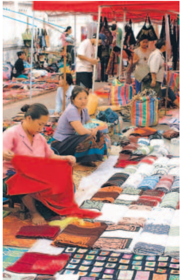
Good night: locals sell their crafts at the night market.