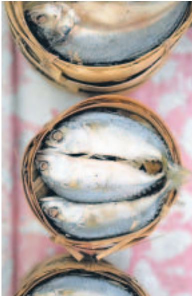
Fine dining: (above) fish for sale.