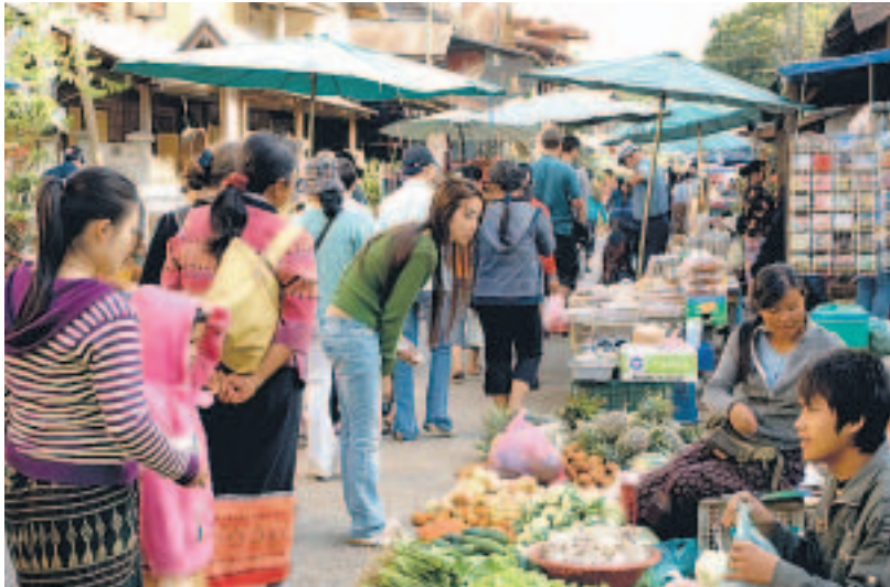
Fresh produce: the morning market at Luang Prabang.